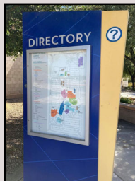
NLV Episode 3 - C Building Hospitality and Culinary Arts Russell's Restaurant Interactive Learning Center