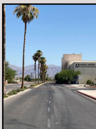
NLV Episode 4 - A Building Morse Arberry Jr. Telecommunications