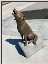
NLV Episode 5 - Tyrone Thompson Student Union ASCSN Student Government, Multicultural Center, Café